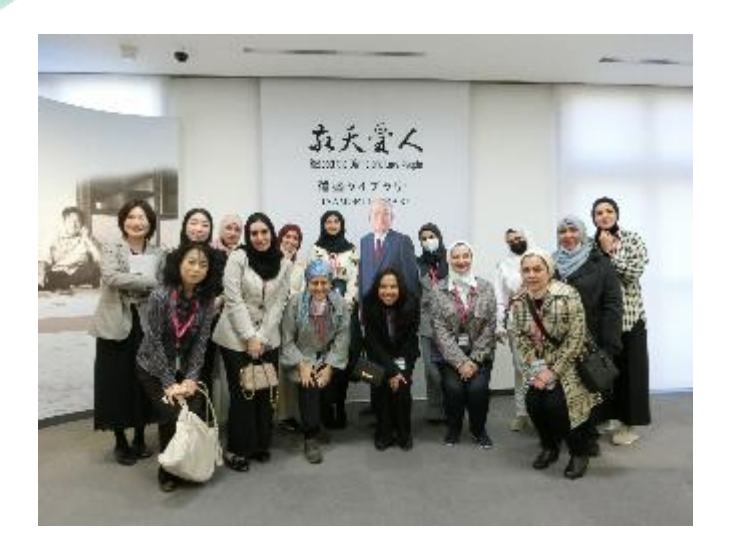
Visit to KYOCERA