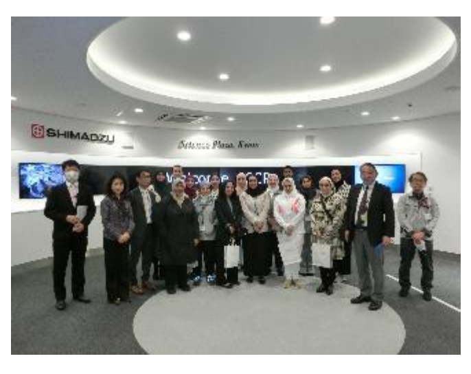
Visit to Shimadzu