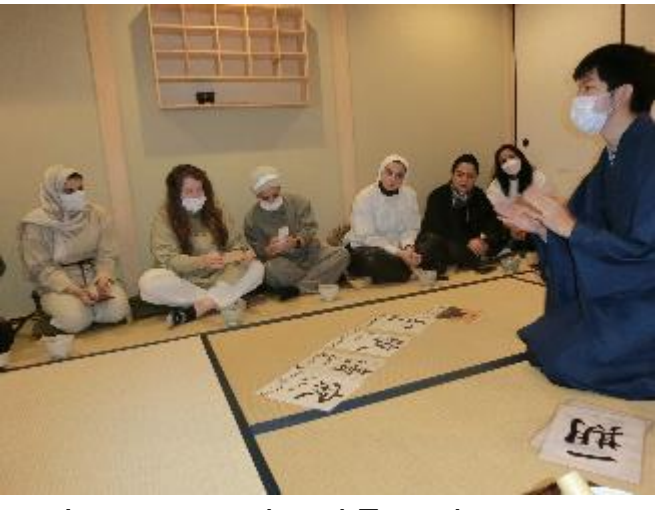
Japanese cultural Experience (Tea ceremony)