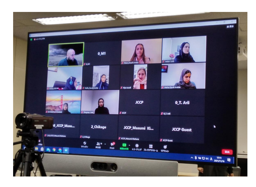
PIC Meetings and FCW Forum were held as an online