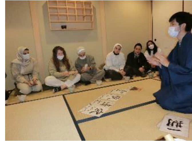
Japanese cultural Experience (Tea ceremony)