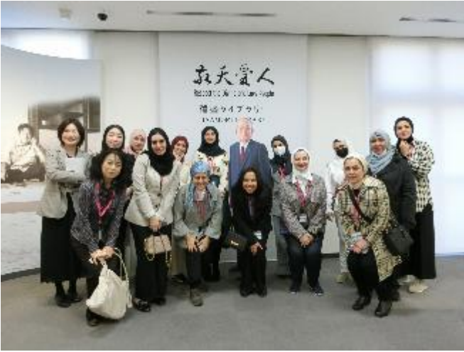
Visit to KYOCERA