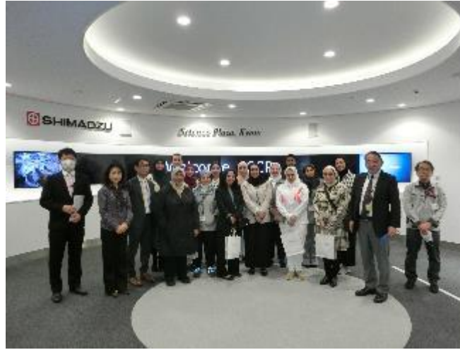
Visit to Shimadzu